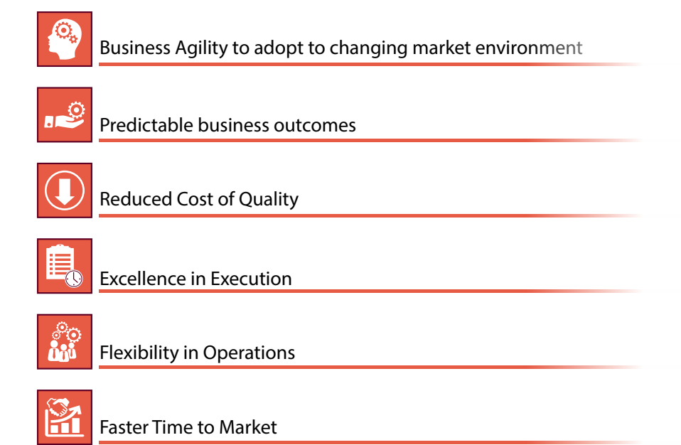
Figure 1: What business wants from QA