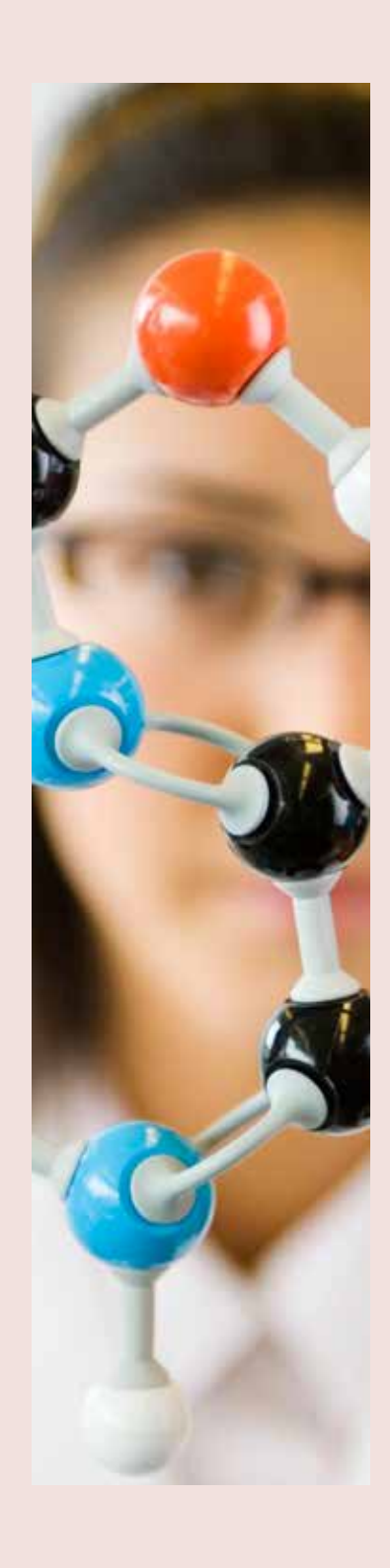
CATALYST SAP SUCCESS STORIES IN LIFE SCIENCES