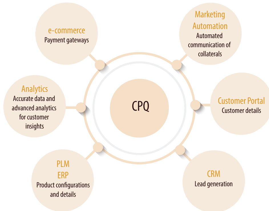
Figure 2. Integrating CPQ with customer-focused systems