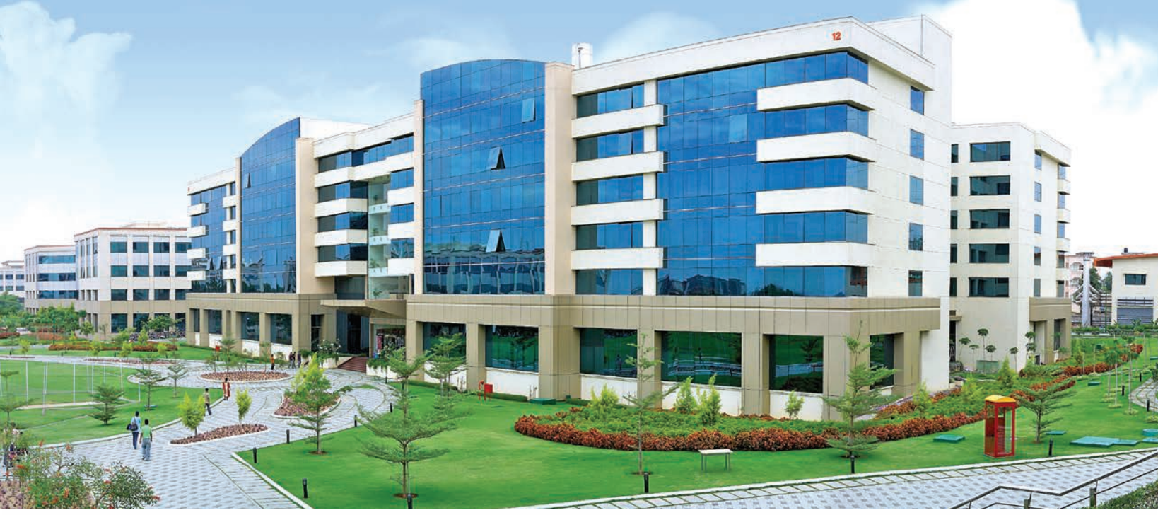
The Infosys campus in Bangalore is constantly monitored for performance metrics